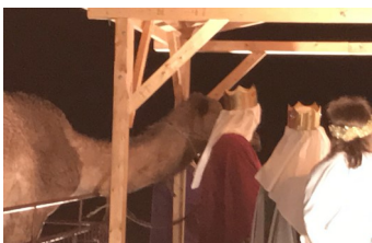
Look who’s nosing his way in to see the Baby Jesus.

HELP US GET THE WORD OUT, THE “FREE” WAY ABOUT OUR LIVE NATIVITY! Pick up flyers to put in coffee shops or at your workplace; also post the flyer to your social media accounts, especially Facebook . If you are on a Next Door app or HOA website , post the flyer to it. Pick up a yard sign for your yard. PLEASE HELP US SPREAD THE NEWS!!