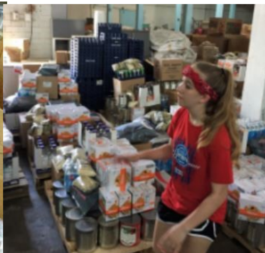
Work at The Way of the Cross—sorting cans/repackaging beans.