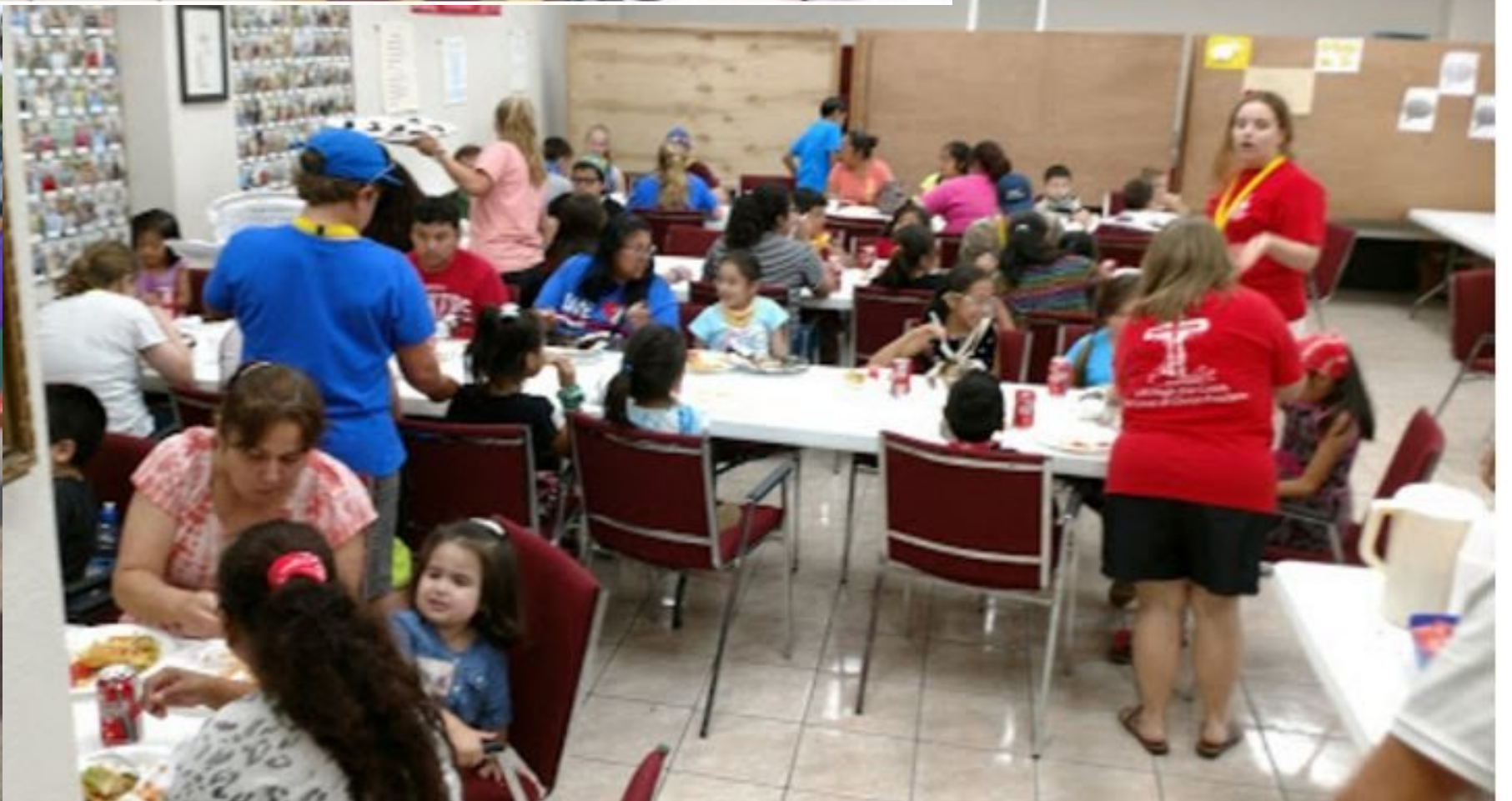
The VBS was pretty traditional with music, crafts, games and Bible lessons.