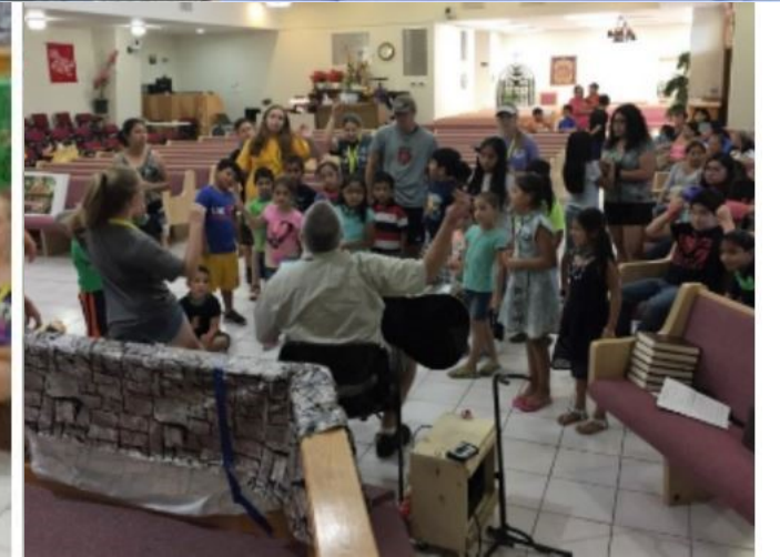
Above & below: Pastor & his usual great job/openings.