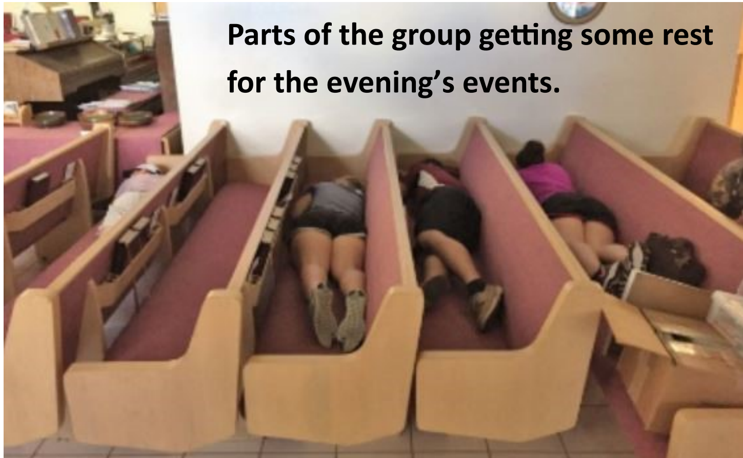
Parts of the group getting some rest for the evening's events.