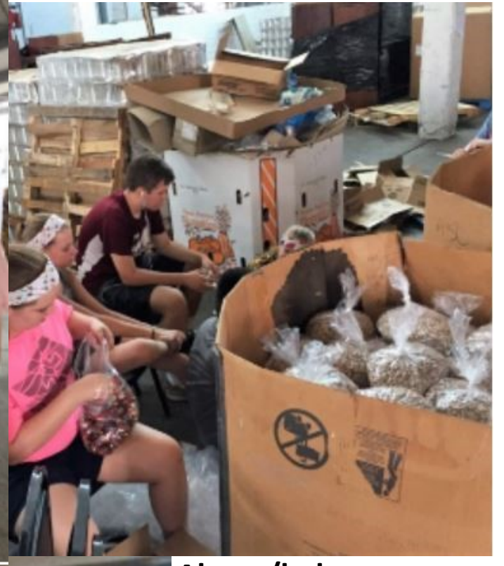
Above/below—a 2000 lb bag 'o beans