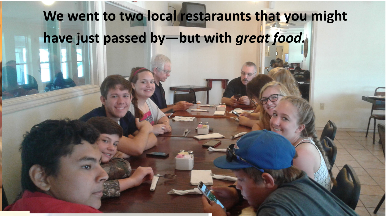
We went to two local restaurants that you might have just passed by—but with great food .